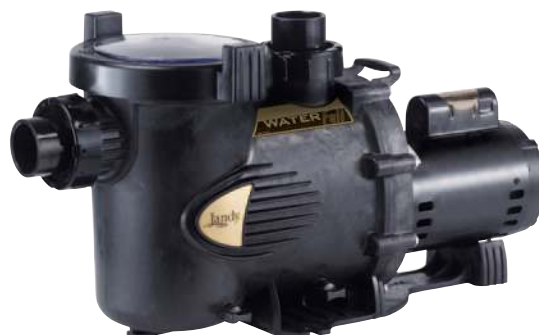
Jandy WaterFall Pump by Zodiac