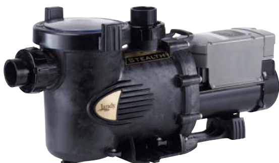
Jandy® ePump™ by Zodiac®