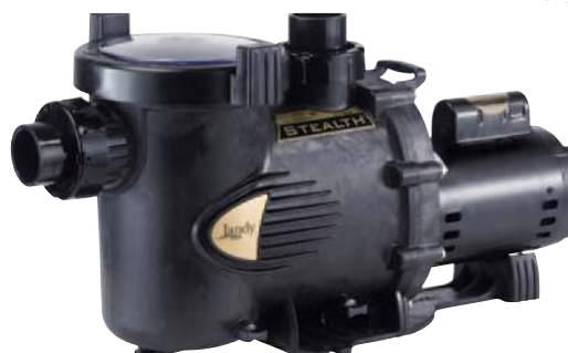
Jandy Stealth™ Pump by Zodiac