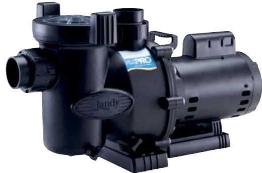
Jandy FloPro™ Pump by Zodiac