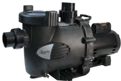
Jandy® Water Feature Pump by Zodiac®