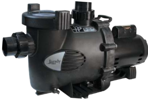
Jandy® PlusHP Pump by Zodiac®